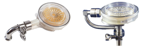
Elbow (left) and Bottom (right) sampling adaptors for remote connection to BioCapt ® Single-Use