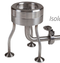
Isolator Monitoring Kit