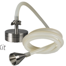
Remote ISP Sampling Kit